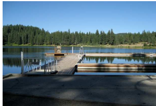
Various views of the camp