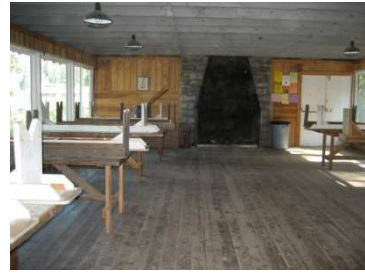
Cabins at Camp Reed